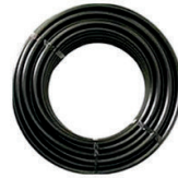
C. 1/2" POLY SUPPLY HOSE (1 - 100 Ft)