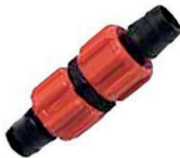
J. TAPE COUPLING (2)