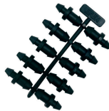
K. MISTAKE HOLE PLUG (10)