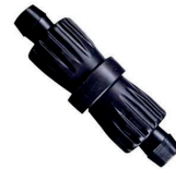
I. HOSE COUPLING (1)